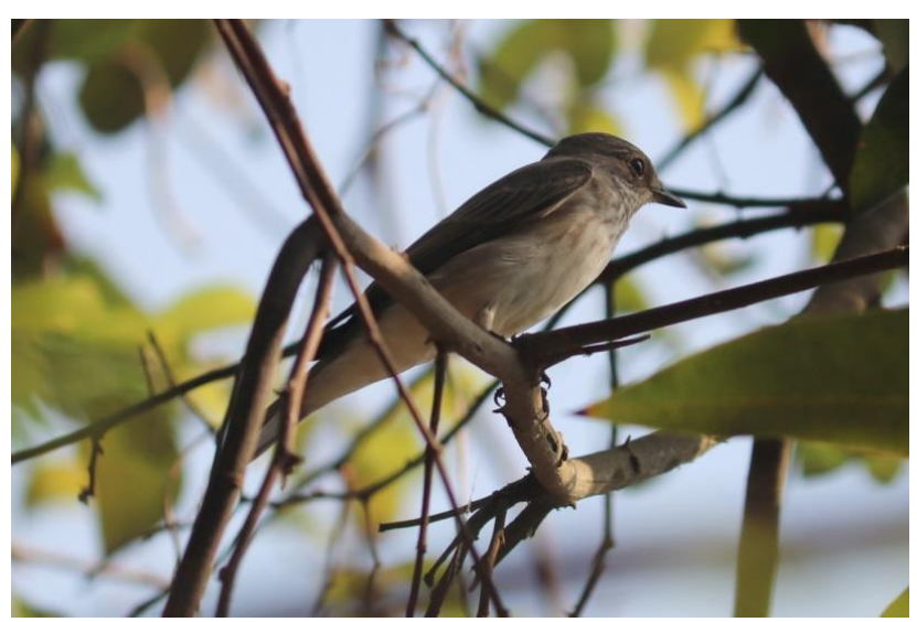
Plate (1): A Spotted Flycatcher Muscicapa striata at Bhubaneswar, Odisha, India.