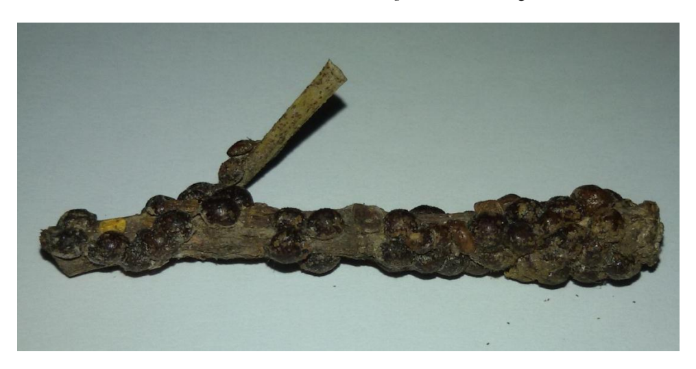
Plate (2): Female adults of P. nigra aggregates along the twigs of fig tree