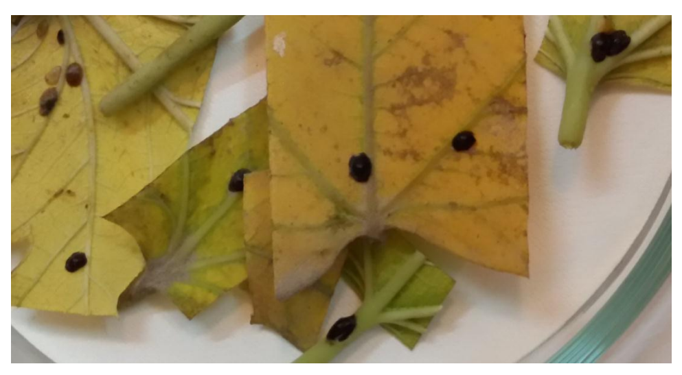
Plate (1): Female adults of P. nigra on leaves of Figs