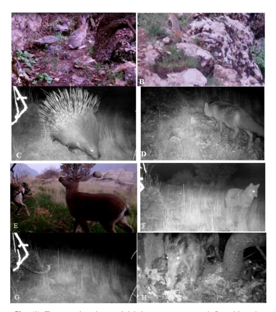
Plate (1): The mammal species recorded during camera trap survey in Bamo Mountain in northern Iraq (Kurdistan); (A) European hare Lepus (Eulagos) europaeus, (B) Caucasian squirrel Sciurus (Tenes) anomalus, (C) Indian crested porcupine Hystrix indica, (D) Red fox Vulpus vulpus, (E) Wild goat Capra aegagrus, (F) Golden jackal Canis aureus, (G) Persian leopard Panthera pardus saxicolor, (H) Wild boar Sus scrofa. (These photos are extracted from video records captured by our camera trap).