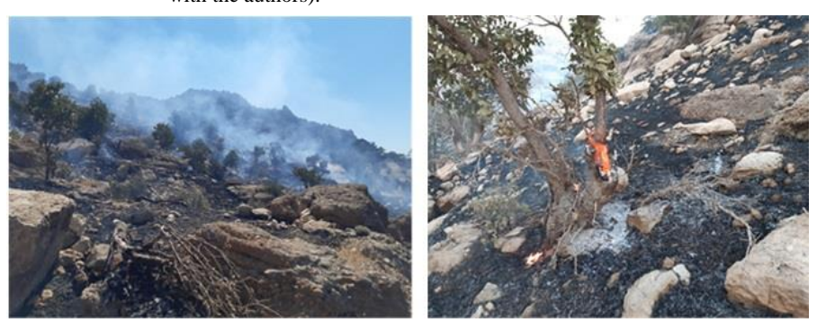
Plate (4): Bamo Mountain during fire.