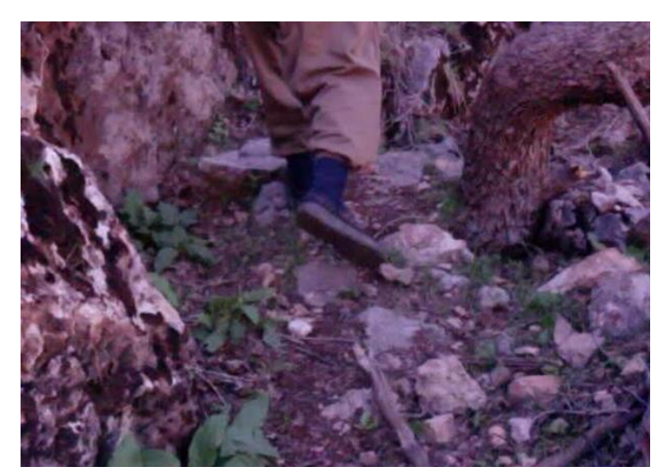
Plate (3): A local hunter in our camera trap trail. (anonymity is preserved with the authors).