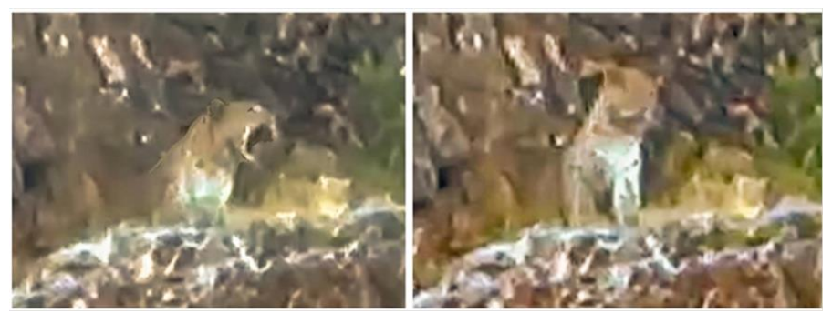
Plate (2): The Persian leopard Panthera pardus saxicolor , a key flagship species recorded in Bamo Mountain in northern Iraq in 2020 (rare photos extracted from a video footage taken by Khalid Sdiq Ahmed).