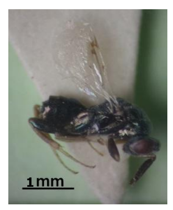
Plate (2): Male of M. obscurus