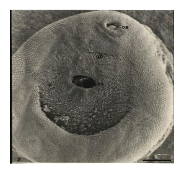
Fig. 2: Scanning electron micrograph of Pleurogenoides medians var. sulaimanialis showing spinulate surface (bar=0.5um). gp, genital pore; os, oral sucker; vs, ventral sucker.