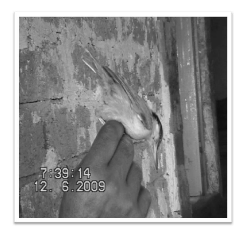
Fig. 1: \textit{Sitta tephronota} \ from \ Besan-Tawera\ valley\ Hawraman\ step\ north\ east\ of\ Iraq.

The study of Mlikovsky (2007), on S. neumay complex classified some variety as a separate species. In our collection we faced some confusion and problem, if we follow mlikovesky we can solve some of these problems.