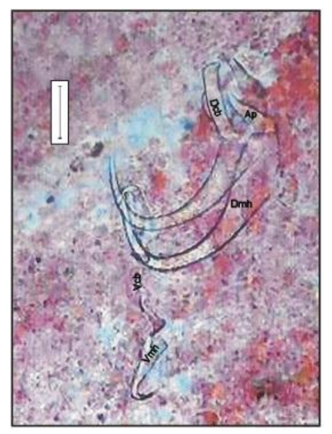
Fig. 2: Photomicrograph of haptor parts (Scale bar = 0.025 mm.).

Ap: accessory piece; Co: copulatory organ; Dcb: dorsal connecting bar; Dmh: dorsal median hook; Hl: hooklet; Vcb: ventral connecting bar; Vmh: ventral median hook.