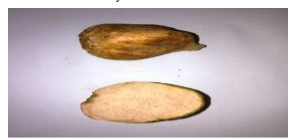
Figure 1. An ascocarp of Terfezia claveryi and a cross section of it.

According to Alsheikh (21,22), the ascocarp of two studied species have lobed shape and diameters of 4 to 10 cm. The studied species T.claveryi and T.pinoyi present different characteristics. T.claveryi has a brownish-yellow peridium and a gleba with fleshy appearance and yellow-pinkish color. Asci are subglobose and contain 8 globose spores ornamented with warts. T.pinoyi has a white peridium, and a gleba with fleshy appearance and white color. Asci are pearshaped and contain 8 smooth globose spores which have double outer layer.