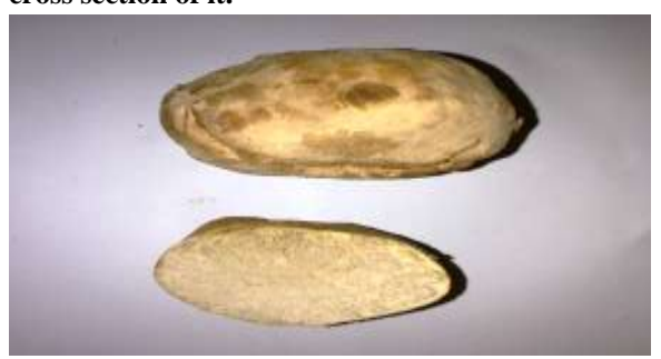
Figure 2.An ascocarp of Tirmania pinoyi and a cross section of it.