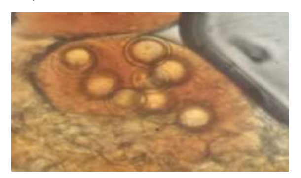
Figure 4.An ascus of Tirmania pinoyi which contains 8 smooth globose spores (colored with alcoholic iodine, magnification \times 40 ).

The results of detection about phytochemical components for dried T.claveryi and T.pinoyi indicate the probability of containing alkaloids, coumarins, flavonoids, phenols, and steroid and triterpenoid glycosides. T.claveryi also may contain little of saponins (Table 1). This is the first time that determination of chemical composition to truffle was published.