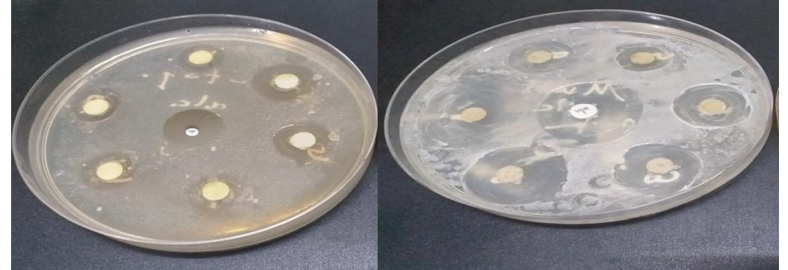
Aqueous extract (A)Ethanol extract (B)Figure 2. The susceptibility test of Ginkgo biloba extracts against C. albicans .