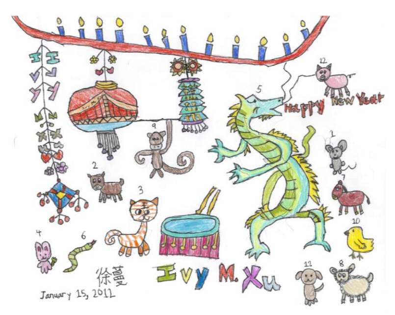
Figure 1. Ivy's Christmas card at age 6

It becomes clear that young immigrant and Canadian born children of immigrants of Chinese background arrive at school with many skills, predispositions, and understandings relevant to numeracy and literacy learning and are already well prepared for this aspect of their schooling experiences. In the section that follows, language learning among youngsters is reviewed.