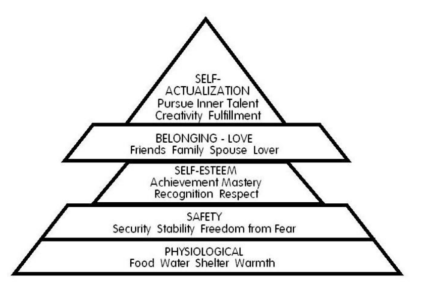
Figure 2. Kunc's (1992) model of the educational system

Kunc (1992) asserts that students who are accepted by others can get their belongingness needs met in schools through popularity, academics, or athletics. However, for those who do not meet traditional or mainstream definitions of success, satisfying the belongingness need can be more challenging. To clarify his point, he created a model based on Maslow's hierarchy which illustrates the idea that achievement is often seen as a prerequisite for belongingness in schools, rather than the other way around (see Figure 2).