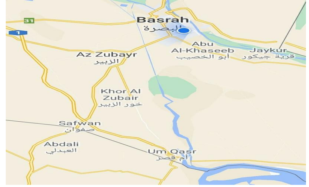
Fig. 2. Southern Basra locations for the samples collected

of water samples in terms of their safety for creatures. This study included water samples from areas of the southern Basra Governorate in southern Iraq (Figure 2).