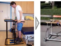
Figure 6. Stand up and stepping-in-place exercise in a standing frame with tetanic stimulation as described in Tab. 1 (8 months)