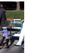
Figure 7. Walking exercise in a walking frame with tetanic stimulation as described in Tab. 1 (10 months)