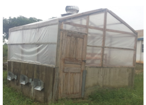
Figure 1b: Solar Tent Dryer