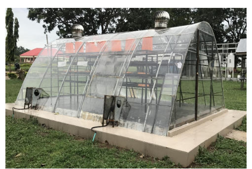
Figure 1a: Parabolic Shaped Solar Dryer

Arid Zone Journal of Engineering, Technology and Environment, December, 2020; Vol. 16(4):785-792. ISSN 1596-2490; e-ISSN 2545-5818; <u>www.azojete.com.ng</u>