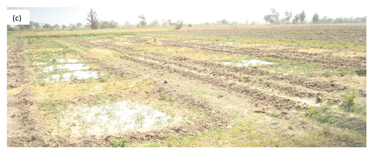
Figure 1. (a) Field setup before water measurement installation (b) Water conveyance PVC pipes before installation (c) Ariel view of the mulch treatment plots.