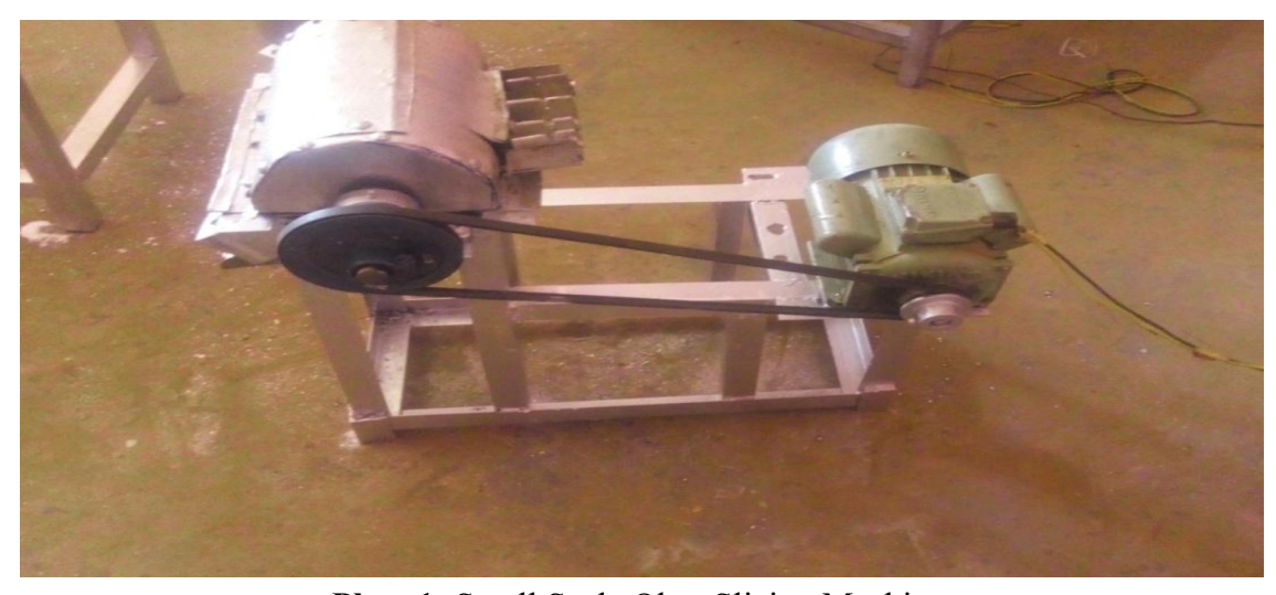
Plate 1: Small Scale Okro Slicing Machine.