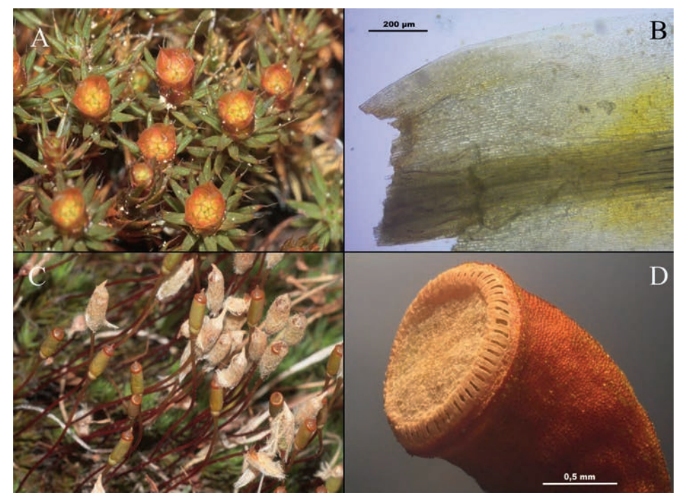
Fig. 1. Polytrichum piliferum Hedw.: A – gametophores, B – fragment of gametophyte leaf with rib, C – sporophytes, D – fragment of capsule with peristome

many species of mosses, rainwater and dew are a direct source of moisture. Water conduction in mosses occurs due to the presence of layers of highly hygroscopic mucilaginous substances that draw in water and distribute over the entire surface of the turf. Water migration also takes place over the surface of leafy stalks, due to capillary forces present in the spaces between the leaves, or through primitive conductive tissue developed in the middle of the stem (Pressel et al., 2006).