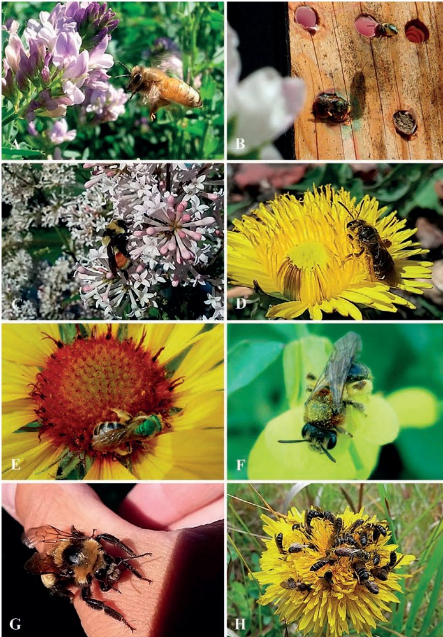
Fig. 2. Some common western North American bee species.

Bees: A - Apis mellifera L., B - Osmia lignaria Say provisioning their nests in a bee block, C - Bombus ternarius Say, D - Halictus sp., E - Agostemon virescens Abrams & Eickwort, F - Andrena lupinorum Cockerell, G - Bombus borealis Kirby, H - Halictus spp.