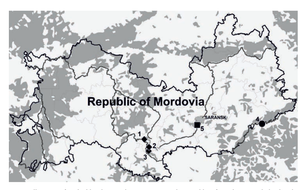
Fig. 1. Allocation of studied localities with Acer species in the Republic of Mordovia. Symbols: rhombs – localities with Acer campestre in Kadoshkino district: 1 – Insar station, 2 – Latyshovka, 3 – Adashevo; 4 (circle) – locality with Acer tataricum and Acer negundo populations in Bolshie Berezniki district; 5 (square) – locality with Acer negundo in Saransk

The field investigation of A. negundo populations were carried out in Bolshie Berezniki district of Mordovia (54.176 N, 46.181 E) and on wasteland in Saransk (54.164 N, 45.150 E) in years 2014–2015 (Fig. 1). Within each of these localities, we