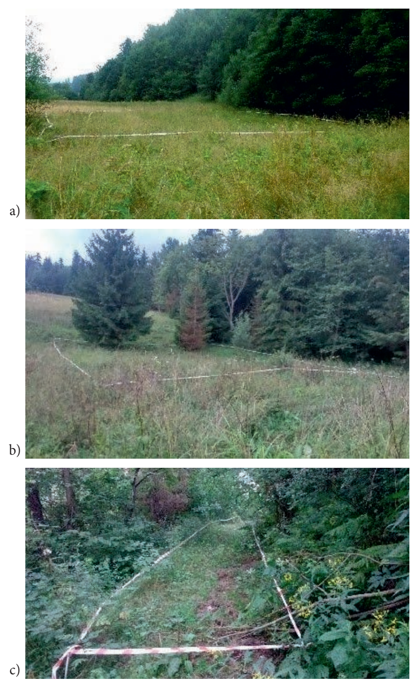
Fig. 1. The location of research to study the seasonal activity of Ixodes ricinus in Ujsoły. Field research: a) – forest meadow near the river of Biała Soła, b) – forest clearing in Danielka, c) – forest path in Ujsoły