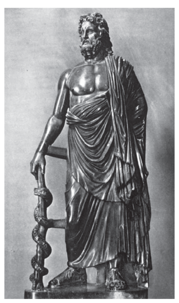
Figure 38: Asclepius/Aesculapius. Bronze statue, 2<sup>nd</sup> century AD. Capitoline Museum, Rome.

Asclepius, Greek god of health and patron saint of physicians, was popularised in the 5<sup>th</sup> century BC, when Asclepian temples of healing first appeared in Epidaurus (Fig. 32) and later spread widely through