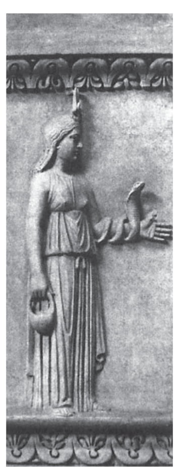
Figure 13: A priestess of Isis, dressed as the goddess with a cobra around her left arm.

Rome. An image of Cleopatra was displayed in the procession, wearing the robes of Isis and with the goddess's traditional armlet (a coiled snake) on her forearm (Fig. 13). Roman spectators ignorant of Egyptian religious symbolism might have interpreted this as suggesting that her death had been caused by a snake — in fact, three Roman poets