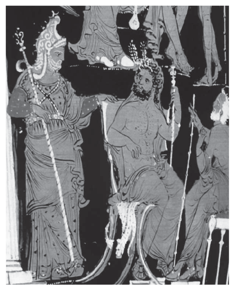
\begin{array}{c} \mbox{Figure 7: The three judges of the Underworld:} \\ \mbox{Rhadamanthus, Triptolemus and Aeacus.} \\ \mbox{Apulian vase, $4^{th}$ century B.C. Staatliche Antikensammlungen, Munich.} \end{array}