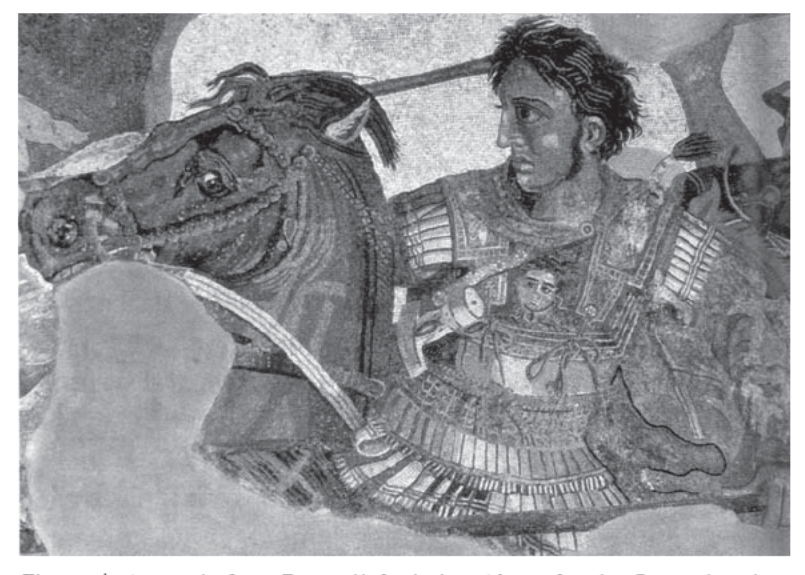
Figure 4: A mosaic from Pompeii depicting Alexander the Great charging on his horse, Bucephalus, in the battle against Darius III at Issus, 333 BC. Naples Museum.

In order to assess the role of combat stress in the specific incident of 326 BC, it is necessary to outline the events leading up to it.