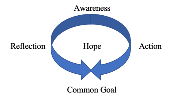
Figure 3. Common Goal

How do we assure that the pain of anti-oppressive work leads to constructive and hopeful action rather than destructive alienation and despair? Our department's experience exemplified the importance of group work for anti-oppressive social work education and practice. Social justice group work (Garvin & Ortega, 2016; Ortega, 2017) and restorative practice are effective means for building community, fighting against institutional and interpersonal oppression, and promoting individual and communal healing. However, the challenges of building trust, setting norms, and facilitating mutual aid call for specialized group work knowledge and skills. By restoring the prominence of group work in social work education (Simon & Kilbaine, 2014), we can build our profession's capacity to resist oppression and contribute to a socially just world.