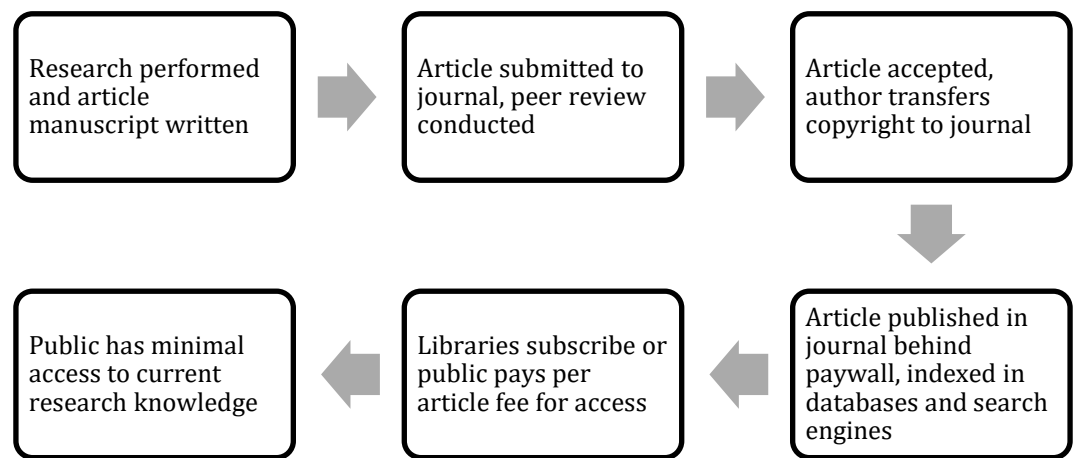
Figure 1. Traditional Publishing Cycle for Research Articles

Figure adapted from Creative Commons (n.d.)