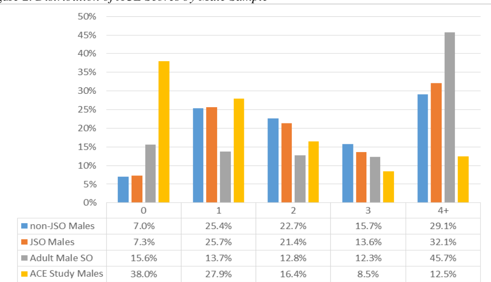
Figure 2. Distribution of ACE Scores by Male Sample

Figure 2 illustrates similar findings. Thirty-eight percent of the ACE study males evidenced zero exposures, compared to only 15.6% of male SOs and 7.3% of male JSOs. Additionally, while 12.5% of ACE study males reported four or more exposures, 45.7% of male SOs, and 32.1% of male JSOs endorsed four or more ACE items. In contrast to the females discussed above (Figure 1), for males, the adult SOs evidenced higher overall ACE prevalence than male JSOs.