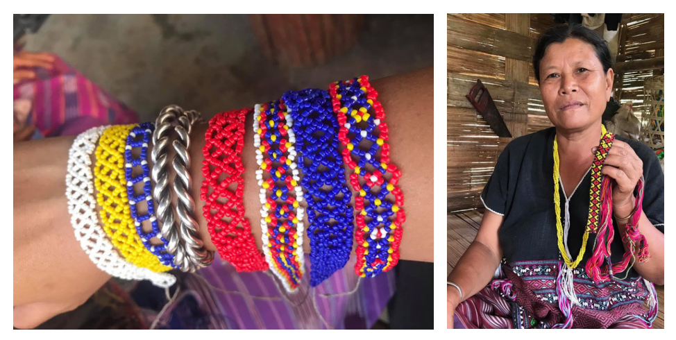
Figure 4 (left). Different styles of handmade bracelets designed by women in the village. (photo by the authors).

Figure 5 (right). A Karen woman who re-created Karen necklaces in new forms. (photo by the authors).