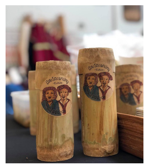
Figure 3. Mue sa to , signature Karen chili paste in a bamboo container made by a villager. A version based on local recipe, with logo and packaging designed by iCulture, is sold on Facebook and in iCraft, the museum shop of RILCA's Vivid Ethnicity museum caravan. (photo by the authors).

depending on typical ingredients, leading to various types the year round. It is safe to say mue sa to represents the essence of Karen food culture. During this research, the Karen of Doi Si Than modified the meaning of the mortar and mue sa to to serve as cultural products that could be marketed and sold to the public.