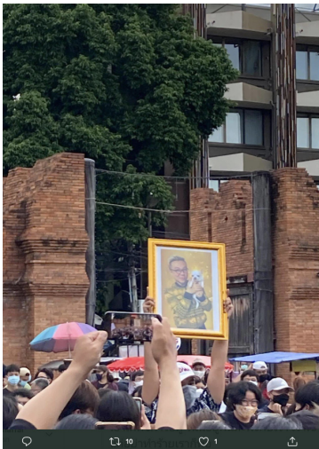
Figure 4 (left). Demonstration in Chiangmai on 19 July 2020. Demonstrators holding up the photo of Pavin Chachavalpongpun. (Photo taken from the Facebook account of Pavin Chachavalpongpun).

SCHAFFAR: Is there more about this aspect of being camp and queer? I’m asking because the current democracy demonstrations were preceded mid-April by a campaign on Twitter – a so-called memes’ war (see Schaffar & Praphakorn, 2021, this issue). A young crowd from Thailand, Hong Kong, and Taiwan used memes to discuss about authoritarianism and the monarchy, and the central hashtag #MilkTeaAlliance trended globally with billions of clicks. The interesting thing is that this started in the fandom of a Thai homoerotic Boy Love TV series “2gether – the series” (เพราะเรารักกัน).