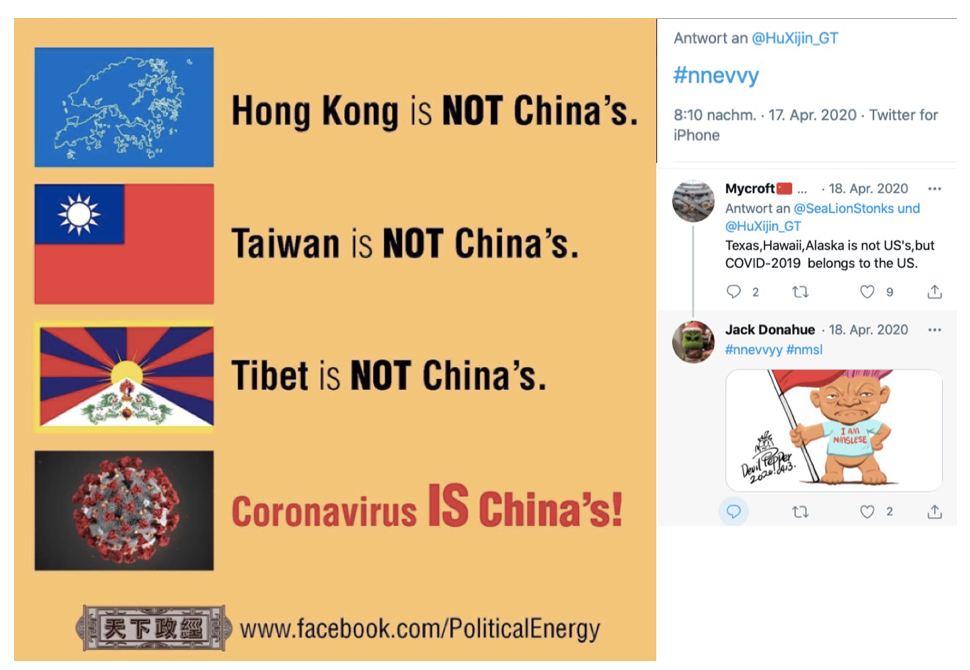
Figure 13. A meme used to counter Chinese nationalists' attack on Nnevvy. (Donahue, 2020).

Such postings directly mirror the PRC public relations campaign, which tried to portray China as the solution and not as the source of the COVID-19 crisis. As a reaction to reproaches of being ungrateful, the Thai side countered with memes stating that COVID-19 was actually coming from China. Many of the memes used by the Thais were retweeted from other threads, such as the meme in Figure 13 from the US-based anti-CCP channel, Political Energy (天下政經), which combines the critique on China's Corona crisis public relations' initiative with notorious issues of Hong Kong's and Taiwan's sovereignty.