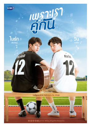
Figure 3. Cover picture of the BL series แพราะเราคู่กัน (literally "because we are a couple"), official English title 2gether – the series. (GMMTV, 2019).

The Thai pop star, Bright, who was attacked by Chinese internet users because he carelessly re-tweeted a message in which Hong Kong was called "a country" (ประเทศ), plays one of the leading characters in the BL series 2gether – the series .