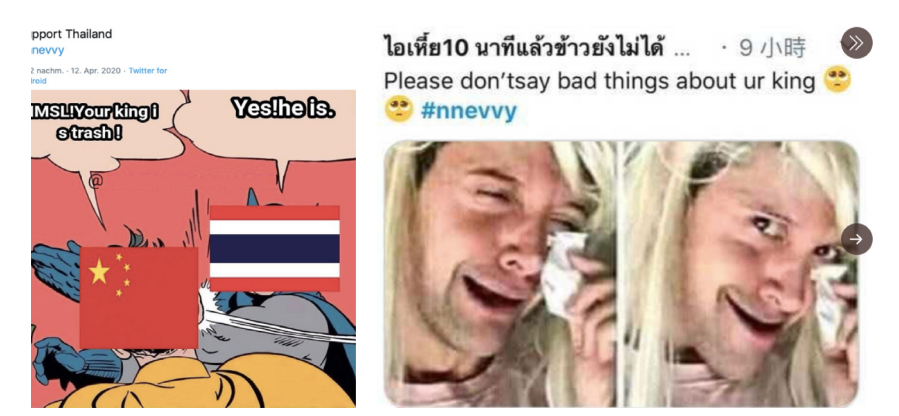
Figure 1 (left). Meme on the Thai King "NMSL! Your King is trash – Yes! he is.". (Twitter, anonymized tweet, 12 April 2020).

Figure 2 (right). Meme on the Thai King "Please don't say bad things about ur king". (Tayn. HK, 2020).