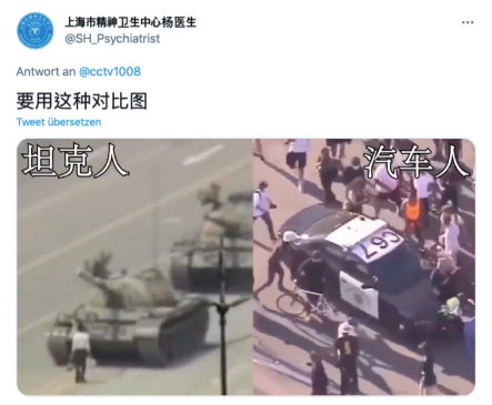
5:05 nachm. · 30. Mai 2020 · Twitter for Android

Even more, the tactics of Thai pro-democracy bloggers were partly copied and used against them. The meme in Figure 22, produced by state propaganda, with two juxtaposed video clips is an example for this.