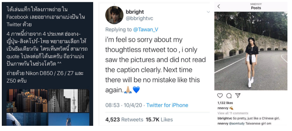
Figure 4 (left). Retweet by Bright, calling Hong Kong a country 'ประเทศ'. (Poetry of Bitch, 2020a).

This exceptionally high attention of the series is the reason why Bright's posting on 9 April triggered such a large reaction. Since all of his moves and postings were closely followed, the single sentence "four pictures from four countries – Hong Kong, Japan, Singapore, Thailand" (emphasis added), which was actually part of a product placement for a Nikon reflex camera (see Figure 4), could draw so much attention. When Bright's girlfriend published a posting saying that she considered herself looking like a Taiwanese, not like a Chinese girl (see Figure 6), this prompted a strong reaction by nationalist Chinese Twitter and Weibo users, who saw Bright's and Nnevvy's comments as an attack on the One-China policy of the Chinese government. Despite Bright's immediate apology (see Figure 5), their accounts were flooded.