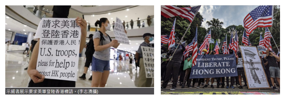
Figure 18 (left). Photo of Hong Kong prodemocracy activists demanding the invasion of Hong Kong by US troops. (Global Times, 2020b).

Figure 19 (right). A splinter group of the Hong Kong prodemocracy demonstrators. (Hong Kong Autonomy Action, 2020).