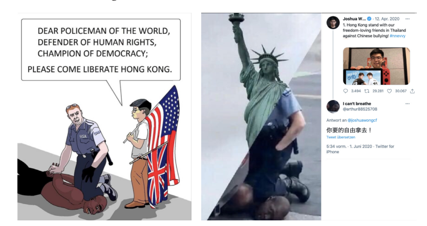
Figure 20 (left). A meme showing Joshua Wong asking the US security forces for intervention in Hong Kong. (Andrew Hans, 2020).

With memes such as this, the framing of the MilkTeaAlliance as an anti-authoritarian, pro-democracy movement was questioned – at least as long as they referred to a discourse of human rights in the tradition of the United States.