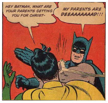
Figure 7. Meme of the meme family "Batman slapping Robin" aka "My parents are dead". (https://knowyourmeme.com/memes/my-parents-are-dead-batman-slapping-robin).

template<sup>8</sup>. In the early parody of 2008, Robin asks what Batman will get from his parents for Christmas, and Batman answers: "My parents are dead" – a sentence that emerged as a secondary tag<sup>9</sup> for the parent pic on the internet.