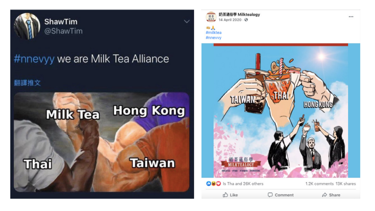
Figure 10 (left). The promotion of the concept of Milk Tea Alliance. (ShawTim, 2020). Figure 11 (right). The café Milktealogy in Hong Kong promotes illustrations for the new concept. (奶茶通俗學 Milktealogy, 2020).

The claim of a family relationship has a long tradition in the modern history and diplomatic relations between the two countries (Kornphanat Tungkeunkunt & Kanya Phuphakdi, 2018). It was used to encourage the integration of overseas Chinese into Thai society at the beginning of the twentieth century and played a crucial role in the normalization of Thai-Chinese relations during the Cold War<sup>11</sup>. However, against the backdrop of the arrogant and authoritarian wording of the Embassy, the often-cited blood relationship was explicitly rejected by the bloggers. Instead, they promoted milk tea as a counter concept – a drink that is popular among young, urban middleclass kids in various countries around East and Southeast Asia<sup>12</sup>. The Thai hashtag #ชานมขั้นกว่าเถือด (milk tea is thicker than blood), alongside the English and Chinese counterparts #奶茶聯盟 (milk tea alliance), soon evolved as the central reference for the meme war, which earlier was tagged under the personal hashtags of #nnevvy and #bright. According to #nnevvy, the hashtag was first used by ShawTim, a Twitter user from Hong Kong, and took off the ground when the artists behind the Hong Kongbased café Milktealogy popularized it through heroic drawings that were published on the commercial Facebook account of their business on 14 April (Nnevvy, 2020).