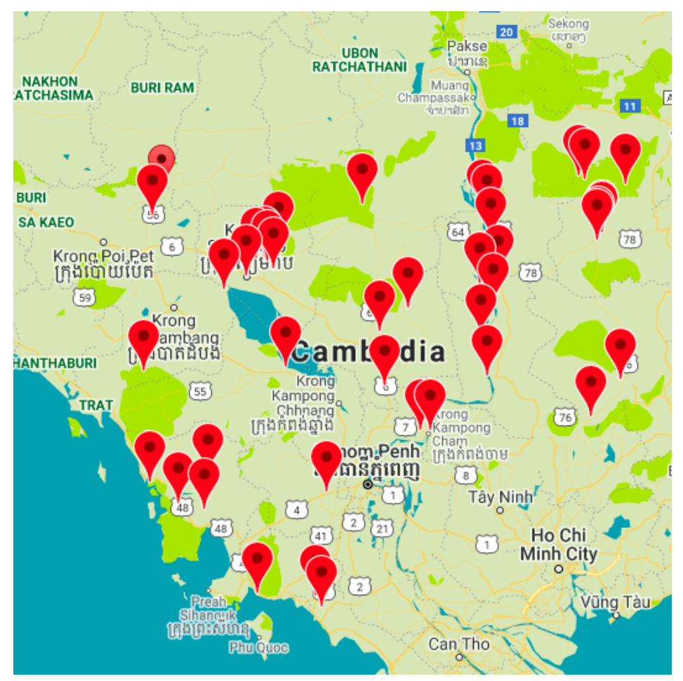
Figure 2: Map of CB(E)T projects in Cambodia. (https://impactexplorer.asia/)

Sustainable Community-Based Tourism in Cambodia and Tourists' Willingness to Pay