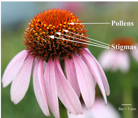
Fig. 1 The inflorescence structure of Echinacea purpurea L.

than 10 inflorescences per plant were bagged several days before blooming to prevent outcrossing. Reciprocal crosses were carried out between diploid and triploid plants as well as triploid and tetraploid plants. In each cross combination, 1500 florets in 10 inflorescences of three plants were pollinated. Pollens were collected from the bagged inflorescences at the full bloom stage, and immediately used for crossing or stored at 4°C. Pollination was performed by directly placing the fresh or stored pollens onto the stigmas of the female parent. Fig. 1 shows the inflorescence structure of E. purpurea . The pollinated inflorescences were bagged to exclude random pollination.