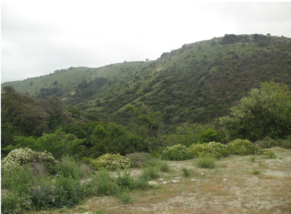
Fig. 4 General view of the Marmara Island's vegetation.