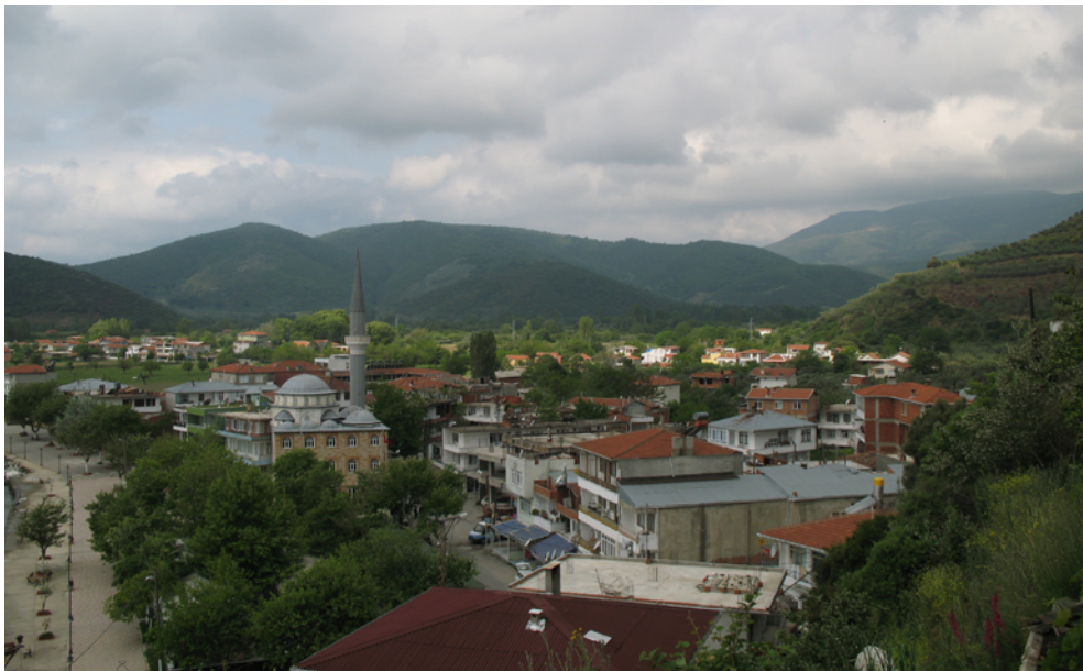
Fig. 2 General view of a village in Marmara Island.