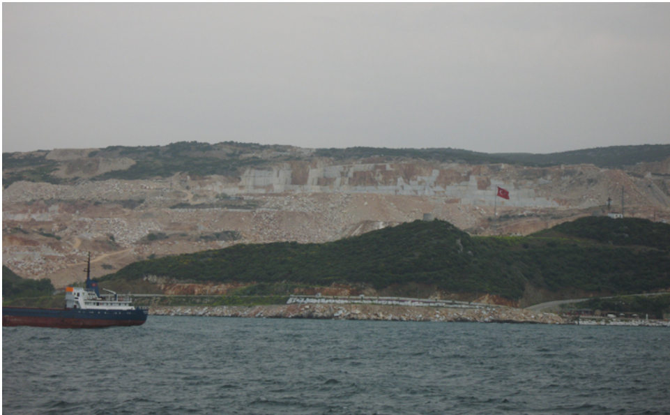
Fig. 3 General view of marble quarries in Marmara Island.

Vegetation cover of the island consists mostly of Mediterranean forest trees, maquis, and frigana (Fig. 4). Besides with plants exposed over large areas, and Europe – Siberia, which is lesser, and Euxine elements are seen in this area [87].