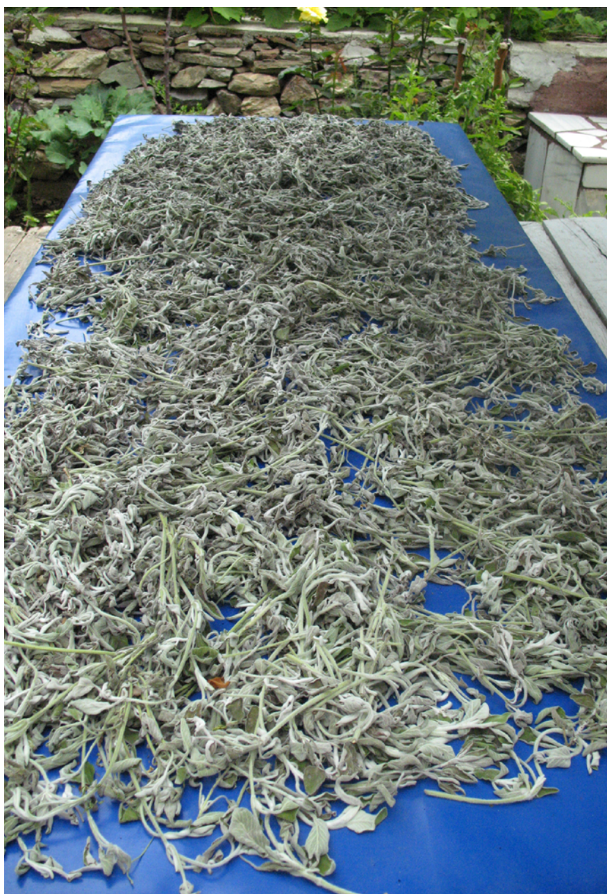
Fig. 5 Dried aerial parts of Salvia fruticosa .

Of the three women interviewed, two stated that they gather Arbutus unedo , Ficus carica , Rosa canina , and Rubus sanctus while on short walks of the island, and use these to make jam and pekmez.