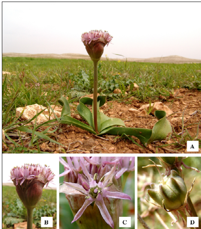
Fig. 1 Allium olivieri Boiss. a General view in the natural habitat. b Inflorescence. c Flower. d Fruit.