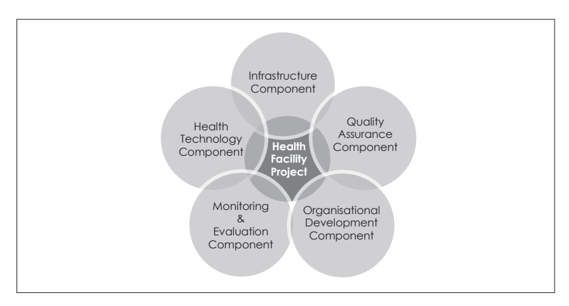
Figure 2: Components of the HRP

components are meant to be managed together in order to achieve the objective of the HRP. The implementation of the components of the hospital revitalisation programme in a health facility project enhances the strategic benefits from core delivery objectives of each administrative programme in a department through a programme management approach.