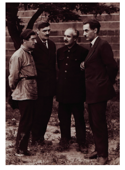
The Administrative Board of the University (1926)

take rather a long time. The task was successfully carried out with the help of the government. A great number of lecturers were invited to give a lecture here. Among the newly formed staff there were also local specialists who, prior to lecturing at the University, had worked in Gevorgian Academy and Nersisian School. As to those invited from abroad, they had graduated the