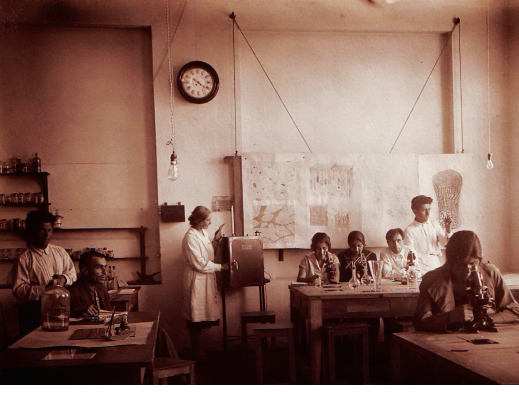
a University laboratory at work (1924)

Armenian specialists were not only out of Armenia but very often were unaware of its doings. There were two ways to enroll the University staff. First, it was necessary to engage old and experienced specialists in these efforts. Second, the problem could be solved by training a new staff which would