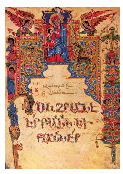
The Testament (miniature)

Currently, the Faculty trains more than 1700 students most of whom are sure to find respective jobs in different companies, organizations, foreign embassies and occupy