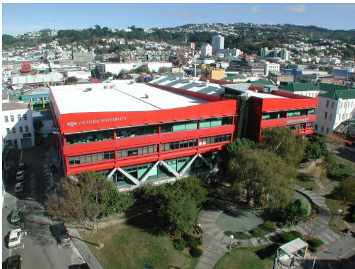
Figure 1: Victoria University's Faculty of Architecture and Design.

Since 1997, a specialist elective course in Sustainable Architecture has been offered. This course is open to all students in the University beyond