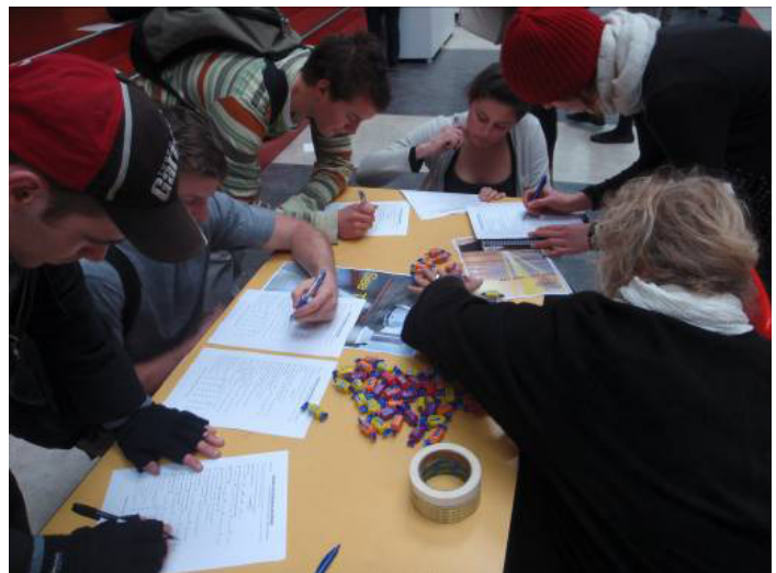
Figure 3: Collection of student opinions at student initiated solar tube exhibition designed to encourage faculty management to install solar tubes to reduce lighting energy consumption while improving the quality of some interior spaces.

stamped their own permanent logo onto the bottom. This stamp was easily identifiable and to try to start a trend, cups were given away to well known and respected staff and students on campus. The rest of the cups were sold for a small fee to cover costs in a festive event in the main atrium of the campus, drawing attention to the initiative. Students documented the process through photography and drawings and for the final part of the project, transformed their collected images and designed logo into posters. These were put up around the campus and at the cafes. Figures 3-5 illustrate some of the interventions that other groups of students devised.