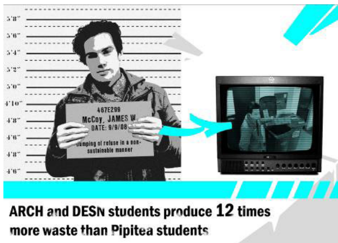
Figure 5: Posters targeting waste producing behavior using popular students as the subjects and setting up inter-campus competition.

The last and perhaps crucial part of the project was the requirement that students produce individual evaluations of how effective the intervention was in terms of reducing GHG emissions and also as a way to educate others about reducing GHG emissions in a built environment context. This enabled students to reflect upon the meaning of their design interventions and the role of designers as not just creators of structures or objects, but also as instigators or changers of behavior patterns. They were also able to examine the limitations of purely technological solutions to complex climate change issues. Wahl and Baxter (2008) suggest that design education that encourages people to examine their world view and engage in dialogue, leads to more effective problem solving skills than simply learning about how to create more artefacts.