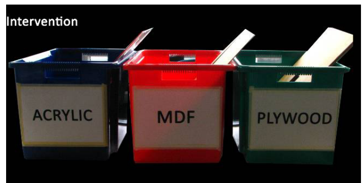
Figure 4: Material reuse station designed to reduce laser machine off cuts and save students money. This was combined with banners and information posted on computers for how to cut materials efficiently when using the laser cutting machine.