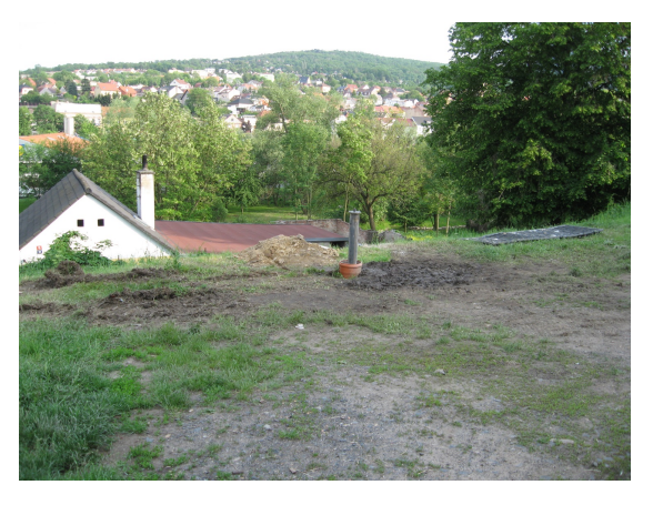
FIGURE 2. Temporary water pressure resistant steel casing of a borehole during realisation (located in an orange KG-System PVC sewage pipe backfilled in the manually dug trench).

The second phase was aimed at the mined part of the tunnel [4]. The above-mentioned drilling technology was applied to reach the bedrock. After that, boreholes were cased with a water pressure resistant steel casing (the result of the CISS requirements); the boring continued with a diamond encrusted drill bit and a double tube core barrel up to the final depth.