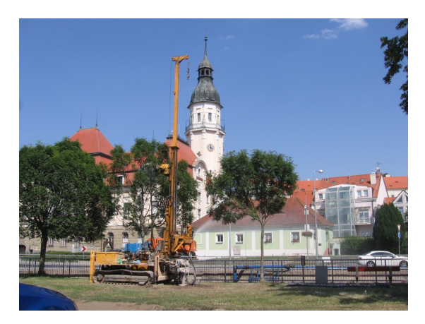
FIGURE 3. Groundwater monitoring well realisation, to the left in the background the historical building of Bílina city hall.

Pressure meter tests were conducted in two boreholes; the tests were performed at three depth levels of each borehole.