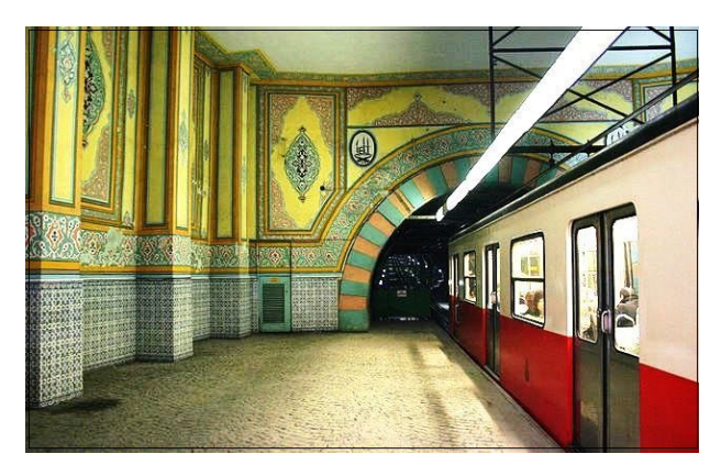
FIGURE 4. Karaköy station of Istambul metro [3]

This solitary underground line, which is currently known by the name of Tünel, was designed by Henri Gavand to be provided with a rope drive. It allowed for a more more comfortable overcoming of the sixtymetre difference in elevation with a steep rise of the surface between Karaköy and Beyoğlu, two city districts lying at the European corner of a bay on the Aegean Sea. The line has only two stations, boarding (see Fig. 4) and disembarking, both with side platforms. A double-car train set covers the distance between the stations in 1.5 minutes, running at a speed of circa 25km per hour. The single-rail track has a passing bay in the middle of the route. The car undercarriages are on rubber tyres and move along a concrete track.