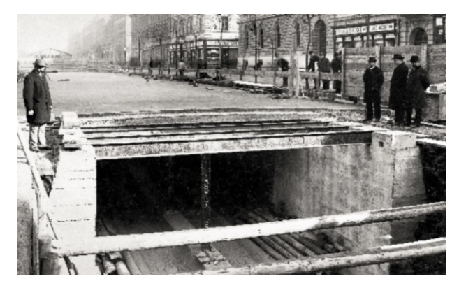
FIGURE 5. Földalatti under Andrassy Avenue [6]