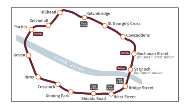
FIGURE 8. Glasgow orbital metro system [4]

The Glasgow orbital metro (officially named the Glasgow Subway, in guidebooks even referred to by a nickname "Clockwork Orange", see Fig. 9) is a double-track system, with each track running through a separate tunnel tube. The diameter of the tubes is probably unique in the world – only 3.35m (11 feet); the track gauge is also atypical – 1,219 mm (4 feet).