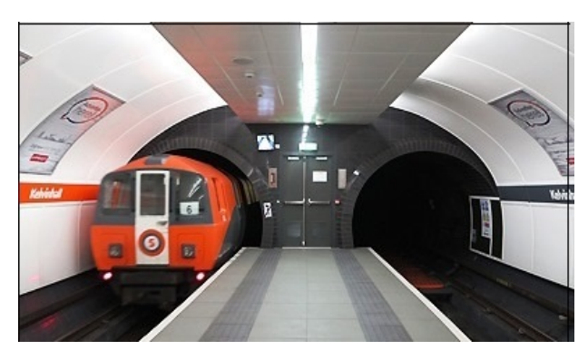
FIGURE 9. Current Glasgow subway – Kelvinhall station [4]

Current Glasgow Metro (Glasgow Subway) is, in terms of the extent, the same as it was 123 years ago – a length of 10.5km and 15 stations. In 1977, it was significantly modernised, equipped with new car sets, a connection with the new depot was installed and electrification of the system was modernised. The minimum diameter of the tunnel tubes (see Fig. 10) and the reduced track gauge was preserved. A welldeveloped proposal for metro expansion, using the already mentioned old mine galleries under the city surface and a relic of historic coal mining, has existed since 2005.