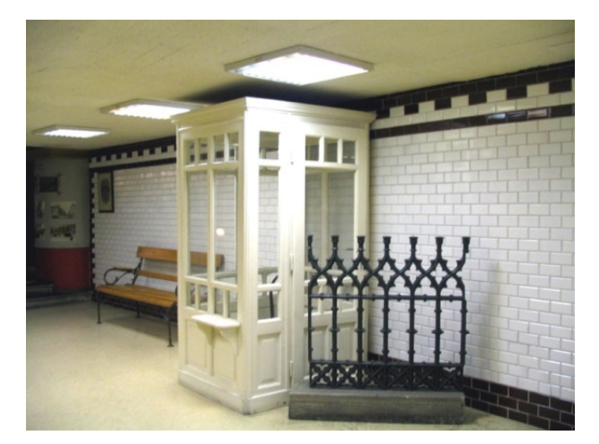
FIGURE 6. Kossuth Lajos Square five-vault station on Line M2 [2]

rest benches and cashier kiosks designed in the same style (see Fig. 6).