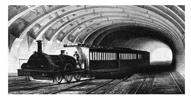
FIGURE 1. Historic subsurface tunnels of the London Underground [3]

With respect to an operation using steam engines and the limited capacity of ventilation through chimneys, the grade lines of tunnels were designed to be at small depths (4 to 8 metres). Horseshoe-shaped profile double-track tunnel linings were constructed on wood centrings in pits dug in the space of streets and were backfilled after completion (see Fig. 1).