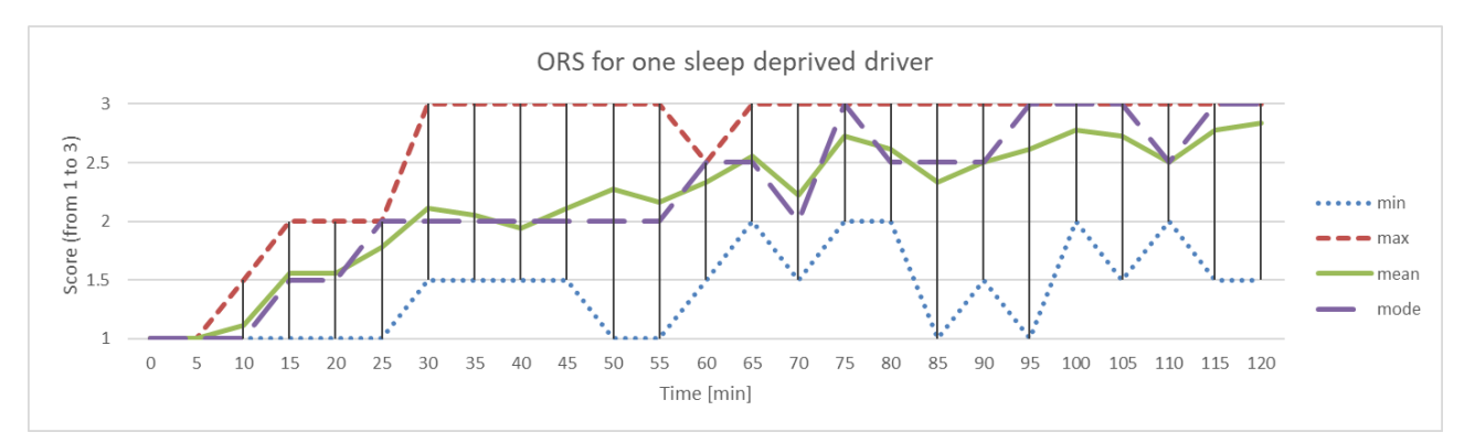
FIGURE 2. Results for ORS evaluation by 9 observers of one sleep deprived subject.