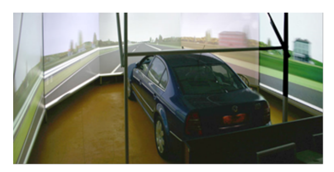
FIGURE 1. Advanced driver simulator for driver drowsiness research.

All observations described in this chapter are related to experiments conducted on a full body (Skoda Superb) fixed driving simulator based on a wide projection angle (210° of driver's view is provided with 5 screens plus 2 screens for side mirrors. See Figure 1 for reference). Detailed description of simulator and lab is provided in [24].