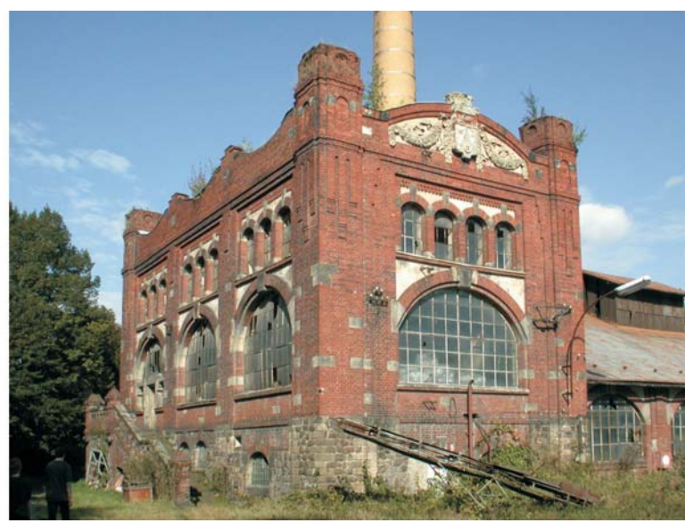
Fig. 2: Category B - stylistic unity. A floodgate. So-called Laudon Pavilion in a Veltrusy palace garden. Built 1792 – 1797 by Matěj Hummel (left). Feigl & Widrich textile mill (later Textilana, A. G.), Chrastava (Kratzau), built 1904 – 1907 by Gustav Sachers and son (right).