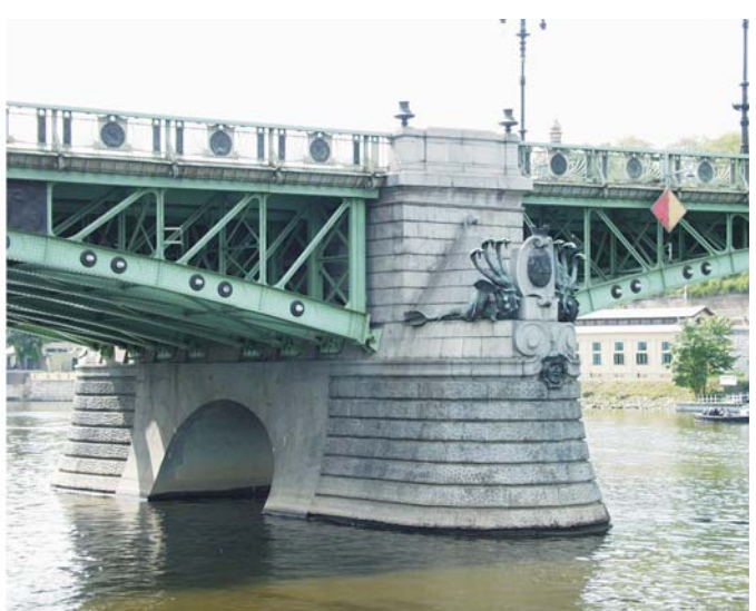
Fig. 7: Svatopluk Čech Bridge in Prague. Built 1908–1909 by J. Koula. A specific vista to Pařížská Street (left). The upstream side of the bridge with coats-of-arms of Prague and water dragons (right).