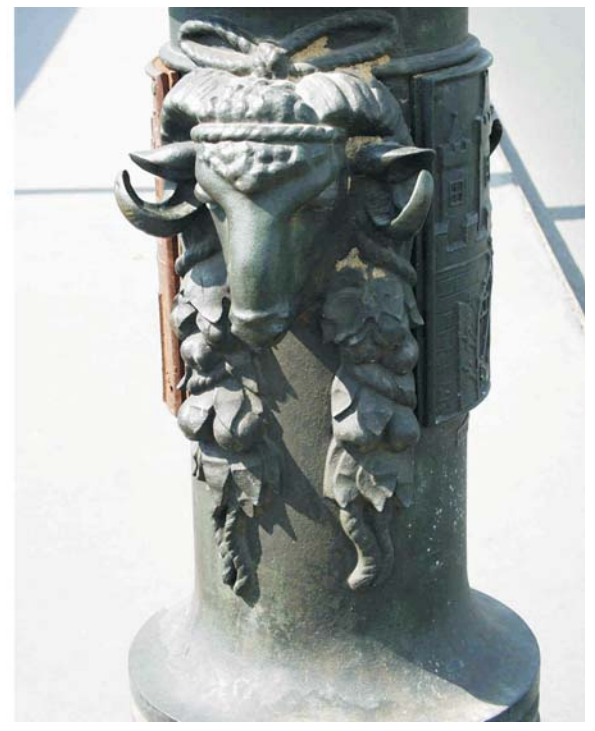
Fig. 9: Svatopluk Čech Bridge in Prague. Built 1908–1909 by J. Koula. The decoration of candelabras – relief works depicting water-related trades (left), a head of a ram (right).