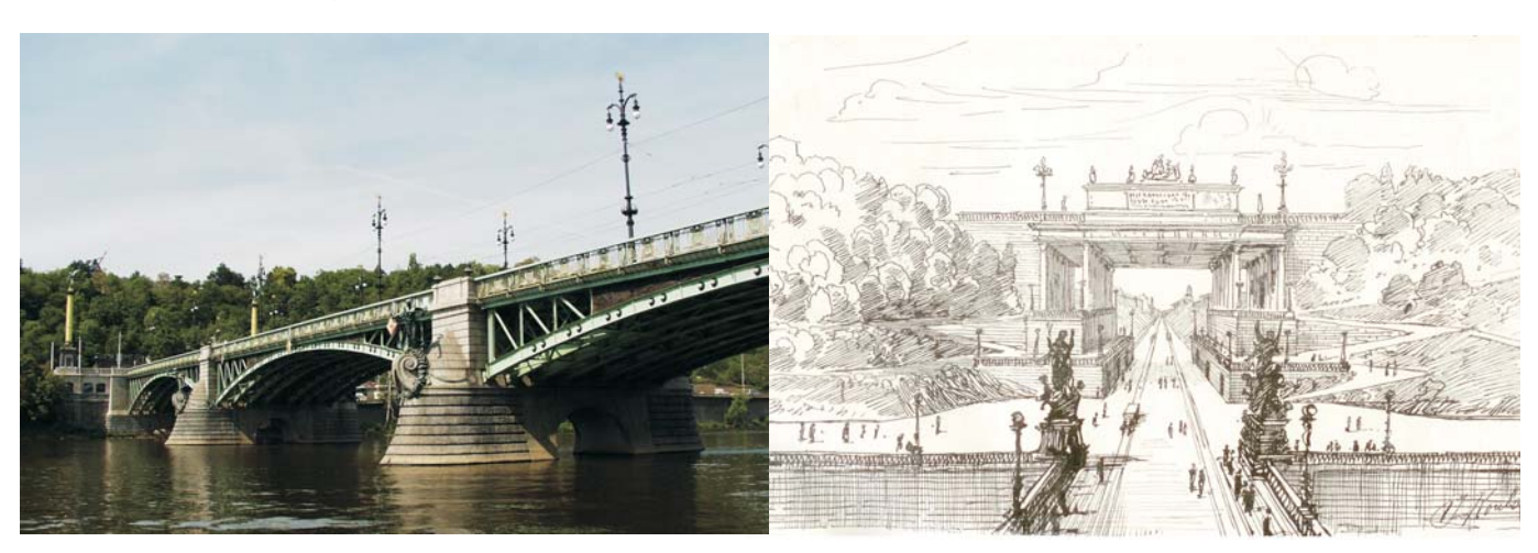
Fig. 5: Svatopluk Čech Bridge in Prague. Built 1908–1909 by J. Koula. The face side of the bridge (left). The design of the triumph arch at the Letná hill by J. Koula, 1897 (right).

As regards form, we have already said that the Art Nouveau Svatopluk Čech Bridge is the continuation of the trium-