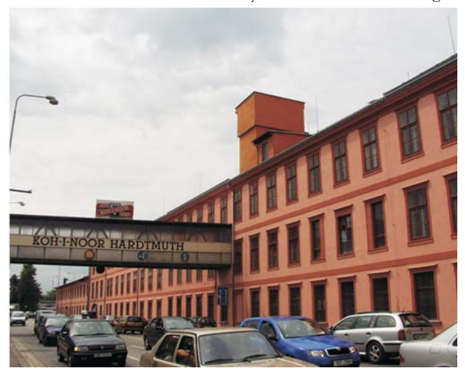
Fig. 4: Category C – value of standard. An engineering works. Koh-i-noor, a.s. (former Waldes and co.) in Praha. Built 1919–1921 by Jindřich Pollert (left). A pencil work KOH-I-NOOR Hardtmuth factory in České Budějovice. Built 1846–1862 and later (right).

Today we admire many industrial structures for their aesthetic appearance, which they acquired from their specific typological class. Paradoxically, however, association with an industrial typology nowadays often underlines the thoughtless destruction of such works. Old technology has been surpassed, and all that remains is the shell of a structure, and its potential aesthetic value is not usually an adequate motive for new investors to make an effort to conserve the building. Moreover, such structures are more complicated to evaluate than other types of buildings, because their urban impact tends to be much broader in scope. When they finish serving their function, it is often necessary to transform much larger