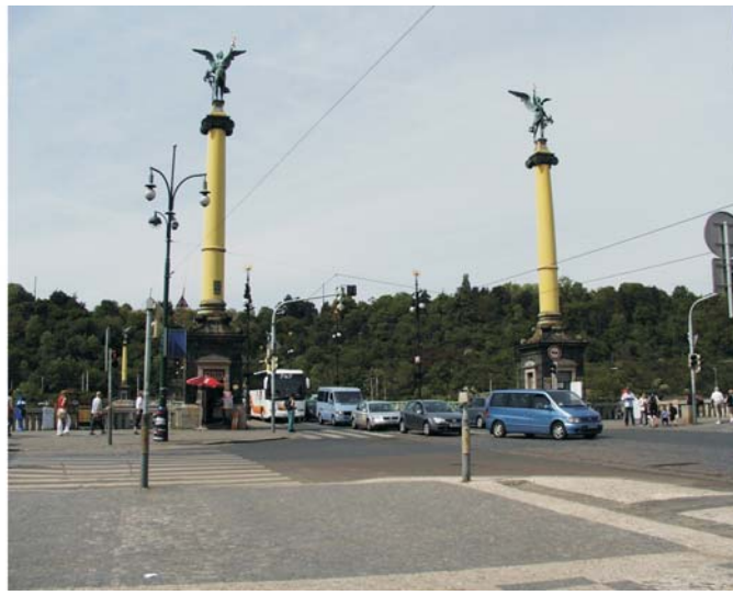
Fig. 8: Svatopluk Čech Bridge in Prague. Built 1908–1909 by J. Koula. Decoration of the spaces between the arches, candelabras and small stone houses on the treshold of the bridge (left). The threshold of Svatopluk Čech bridge with seven-meter-high columns.

which play together in harmony. The guidelines of the arches are marked by a chain of electric lamps that look like grand pearls, supernaturally taken from the depths of the purifying water, as in a Wagnerian opera (Figs. 6, 8).