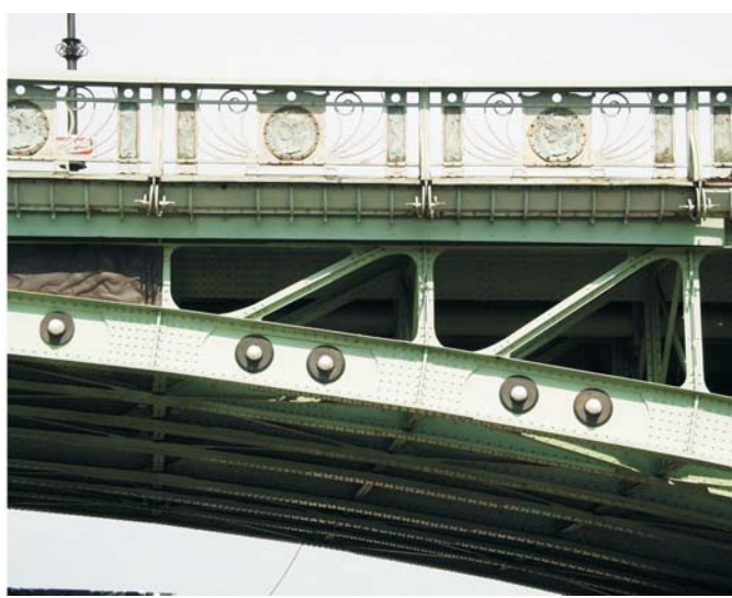
Fig. 6: Svatopluk Čech Bridge in Prague. Built 1908–1909 by J. Koula. The face side of the bridge with an female figure holding a torch (left). The railing with identical medallions with female face, "chain" of electric lamps and relief sculptures (right).

phalism of Parizska Street (Fig. 7). Stylistically, it is a mixture of all historical styles, but without religious accents. In a spiritual sense, the artists and architects preferred pre-Christian motives. The whole project is a manifestation of the optimism and ambition of the era of prosperity, based on modern management, modern technology and a modern social system.