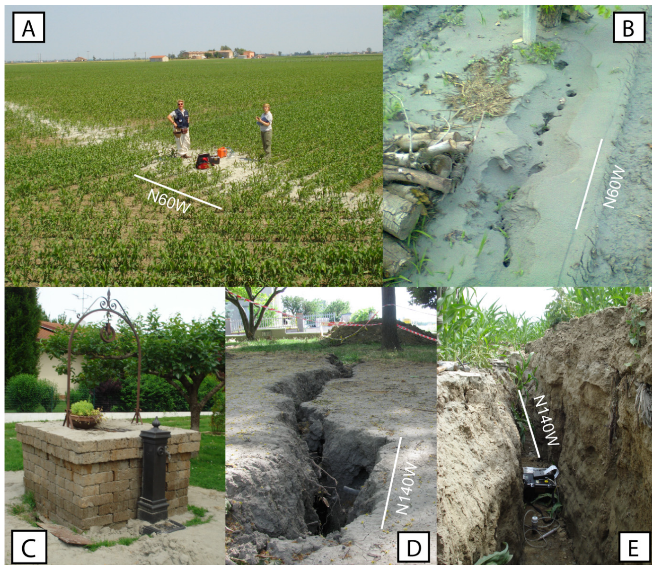
Figure 2. A, B. Liquefactions with N60W direction observed in Via della Fruttarola–Finale Emilia (Modena) corn field and Santa Bianca (Modena), respectively. C. Sand blowout from a well in San Carlo (Ferrara). D, E. Ground fractures with a N140W direction observed in the San Carlo area (Ferrara) soon after May 20, 2012 (see Figure 1 for location map). Geographic coordinates UTM WGS 84 32N.