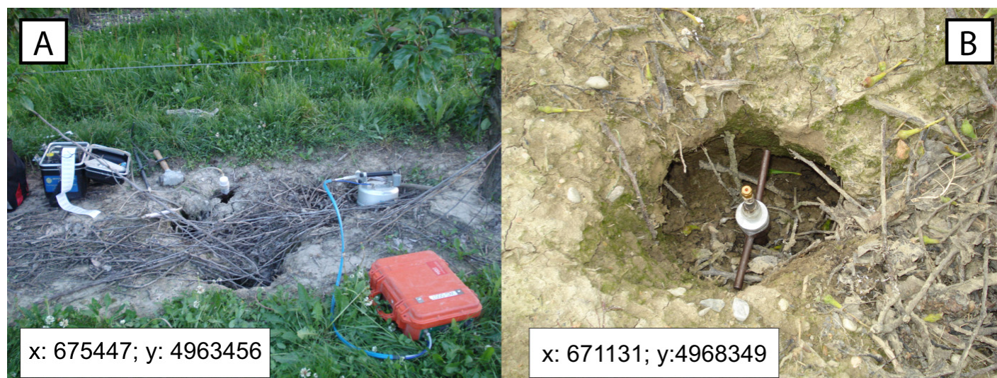
Figure 3. A, B. Soil-gas and flux measurements in collapsed caves. B. Detail of the steel probe driven into the collapsed caves to collect soil-gas samples. Geographic coordinates UTM WGS 84 32N.

not correlated with other pathfinder elements (e.g., 222 Rn and He) [Lombardi and Voltattorni 2010]. This might suggest a local anomaly, which would be likely to be due to surficial layer compression during the earthquake.