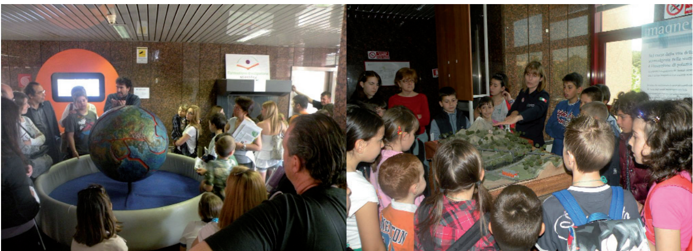
Figure 3. People visiting the earthquake and Earth interior exhibitions.

On May 11, 2011, the INGV opened its headquarters to the public. The program included: