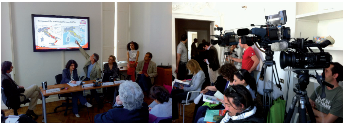
Figure 2. The press conference on May 9, 2011, held in the INGV office in the center of Rome, near the Quirinale.

Bendandi’s theory has never been published in scientific journals, and has remained written in his notes and drawings, which are rather difficult to understand. The INGV is working with the Osservatorio Bendandi of Faenza