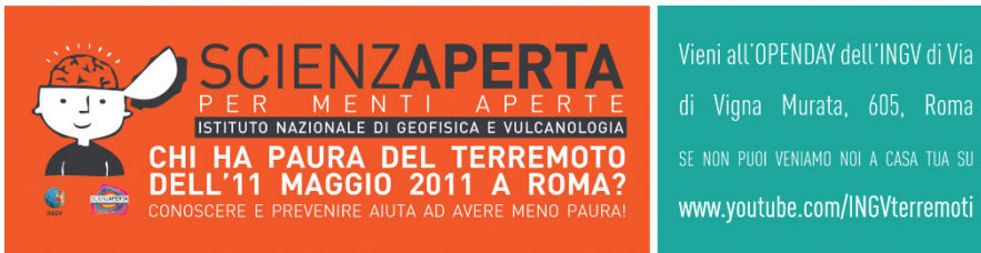
Figure 1. Invitations to the Open Day at INGV, showing the ‘brand’ of the event.