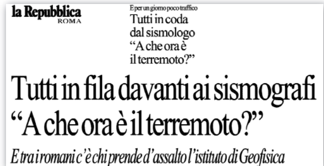
Figure 7. The headline of the daily national newspaper “La Repubblica” that appeared the day after the Open Day on May 11, to testify the extent and the effect of the initiative: “All lined up in front of the seismograph: ‘What time is the earthquake?’ And among the inhabitants of Rome, there are those who invade the Institute of ‘Geophysics’” [Erba 2011].

The measure of the success of this ‘strange event’ is not just the reduction of fear (hard to measure), but rather the awareness that we were ready and able to face a huge