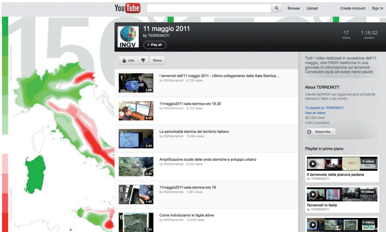
Figure 5. The 15 videos included in the ‘playlist’ named ‘11 maggio 2011’. This playlist include all of the videos recorded for May 11, 2011.

The videos with updates from the INGV seismicity monitoring room also contained some brief, but essential, information about how the seismic surveillance service is carried out, and how the hypocenter and magnitude of an earthquake are computed.