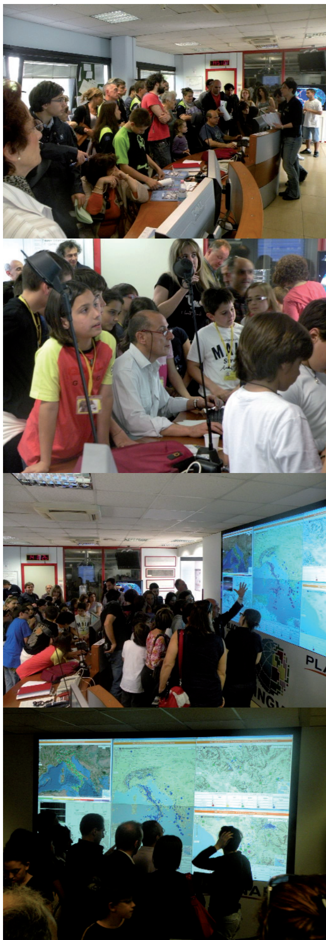
Figure 4. People inside the INGV seismicity monitoring room.