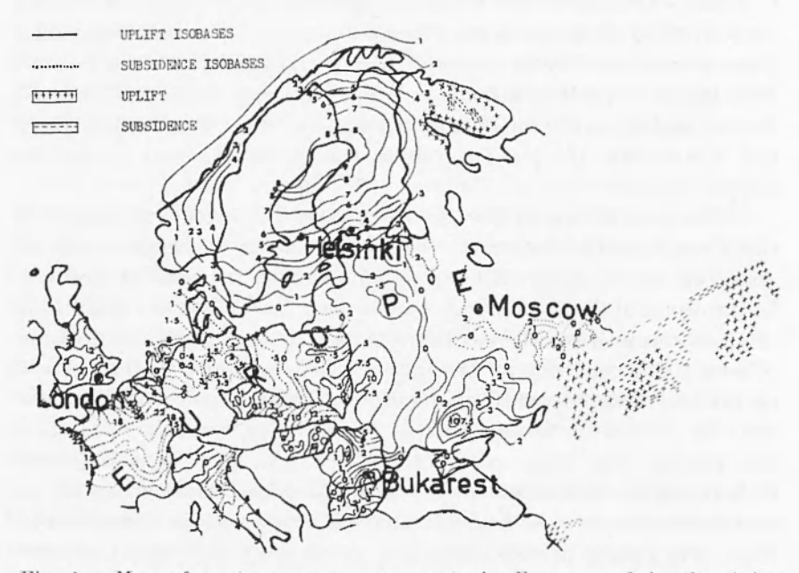
Fig. 1 – Map of contemporary movements in Europe and in the Asian part of the U.S.S.R.

The isobases drawn for Romania make it clear that the tendency of uplift in the south-western part of the U.S.S.R. is continued up to the northern part of Romania where the uplifts have shown the magnitudes of the order of 2 to 7.5 mm/year. The central part of Romania is relatively stable whereas in the southern part of this territory, the movements are more differentiated and are between -1 to +2 mm/year. However, the same differentiated pattern is extended into Bulgaria and other neighbouring areas.