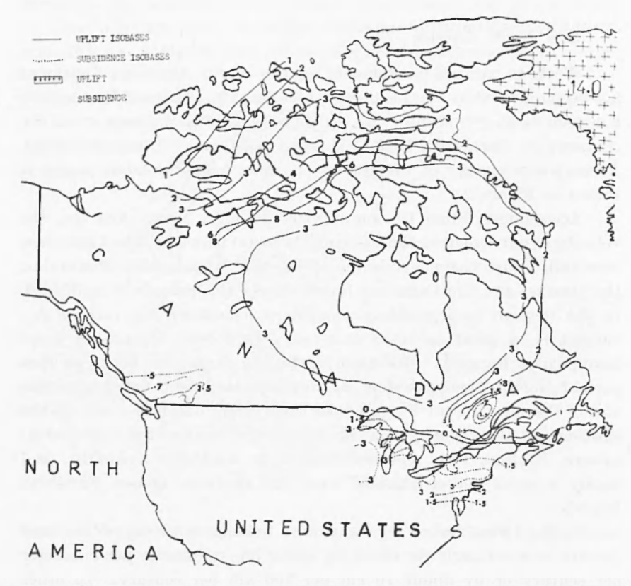
Fig. 2 - Contemporary crustal movements in North America.

to Quebec City at the rate of about 5 mm/year. On the other hand, there are very few and less conclusive indications that have led to the speculation that the high ground in Laurentides Park between Lake St. John and Quebec City is subsiding at about the same rate of 5 mm/year. While this subsidence is definitely indicated by two