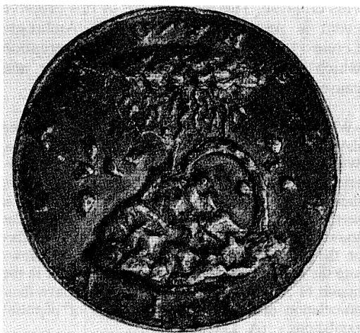
Fig. 2. Probable representation of the 1500 Vesuvius eruption in an early XVI century medal according to Henry Stephen Washington (Washington, 1918).

thermicity in the area of the big central cone and a sequence of important PP. This eruption has not left any stratigraphic deposits, may be because they were so thin as to be eliminated by lahar and post eruptive rains, apart from the intense farming of the inhabitants of the area.