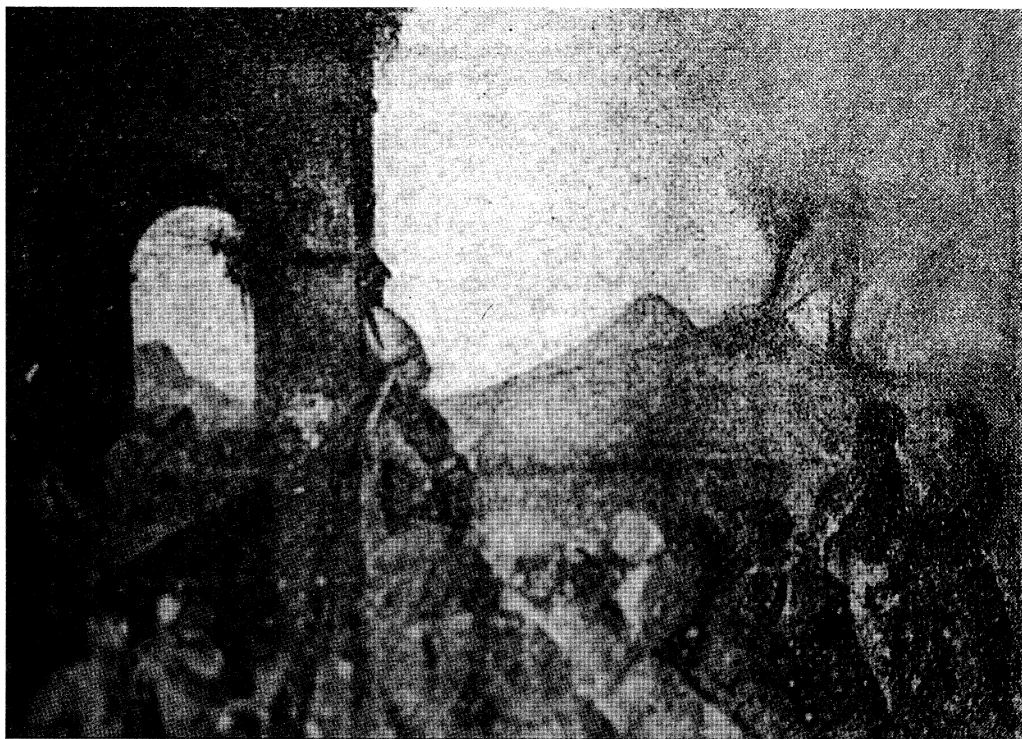
Fig. 1. Fresco of 15th or beginning of 16th century, in the arcade court of the Church of Saint Gennaro Extramoenia in Naples. Today it is no longer visible, but Alfano (1924) luckily published this very important photograph of it. It represents a very evident eccentric eruption of the volcano by vents in the southern area.

top. The top itself is almost completely flat, but it is quite barren, the land having a cinereous appearance; there are cracked cavities, opening on rocks sooty as if consumed by fire. We could suppose that this place previously burnt, and later its fire craters died out as the material burnt completely.» (Strabo, Geography, V, 4, 8).