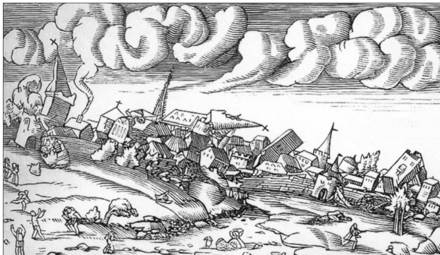
Fig. 2. Illustration (Münster, 1550) of a dramatic situation in which a town is severely affected by an earthquake. Lycosthenes (1557) used this woodcut in connection with his description of the 1356 Basel earthquake – but for many other earthquakes as well ( cf. text). It is therefore not likely that the town Basel is depicted, as assumed by some modern authors.

Rasch (1582a,b, 1591), Beuther (1601), Sigwart (1613) and Bernhertz (1616).