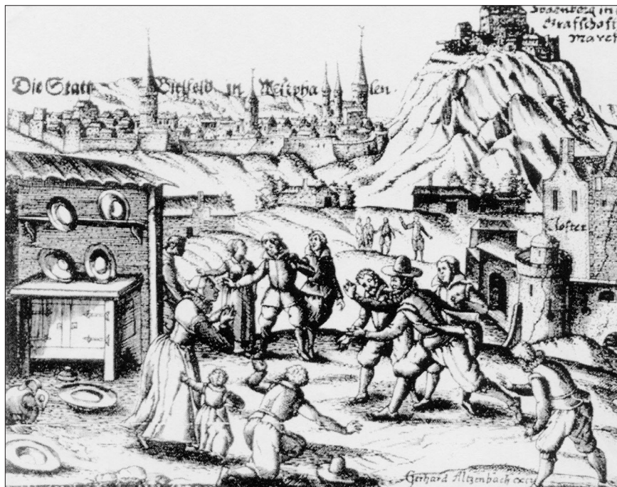
Fig. 3. Contemporary engraving showing the effects of the 1612 Bielefeld earthquake - frightened people, falling pewter ware and damaged buildings ( cf. Vogt and Grünthal, 1994).

Detailed studies on single historical events based on contemporary sources are Wolf and Wolf (1989), on the phantom earthquake in 1062; Grünthal (1992), on the reinterpretation of the Central German earthquake in 1872, the strongest known in eastern Thuringia with extensive descriptions of felt effects from 409 localities (see also above); Meier and Grünthal (1992), reinterpreting a key event in 1770 in NW Germany; and Vogt and Grünthal (1994), on another quake in that area from 1612. The two latter studies resulted in distinctly new source parameters. The 1612 event is one of the few early German earthquakes being subject to a contemporary illustration (fig. 3). This engraving, appearing on a contemporary broadsheet, clearly reflects the effects described by