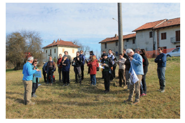
Fig. 4 - The attentive audience (Stop 4), in the sector along the T. Traversola Deformation Zone