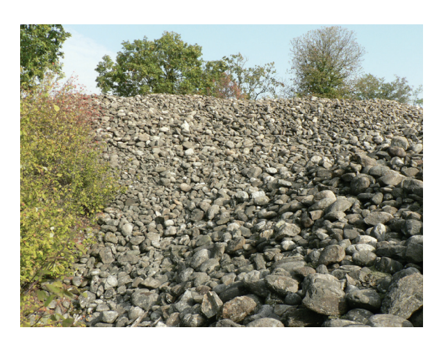
Fig. 7 - The Bessa Aurifodine, a very important site of geoarchaeological interest (Stop 5)

A pair of panoramic stops have allowed us to view