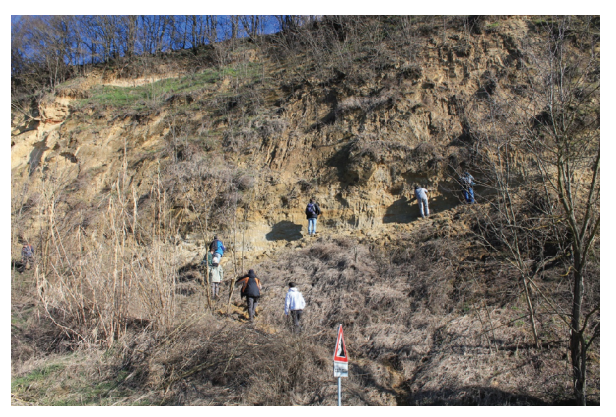
Fig. 2 - Some conveners and attendees observe the deltaic front sand (Ferrere Unit) of the Ronco outcrop (Stop 1)

(graphic design), Edoardo Martinetto (fossil plants), Alberto Mottura and Benedetto Sala (fossil vertebrates) and Donata Violanti (marine microfossils).