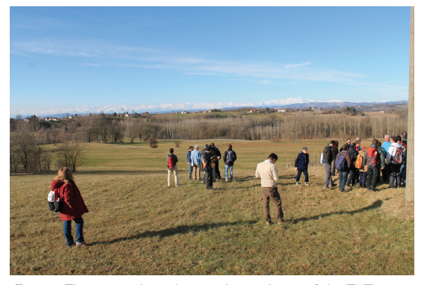
Fig. 5 - The researches observe the evidence of the T. Traversola Deformation Zone (Stop 4). In the foreground the snowy scenery of the Western Alps

(Villafranca d'Asti, in the central sector of the type-area) (Stop 2). These sediments (San Martino Unit) are cut by the Cascina Viarengo erosional surface and covered by fluvial gravel sand (Cascina Gherba Unit). This erosional surface represents an important stratigraphic discontinuity between the Lower Complex (Piacenzian) and the Upper Complex (Calabrian). The thin organic paleosols, rich in organic matter and continental molluscs, were also observed in the outcrop.