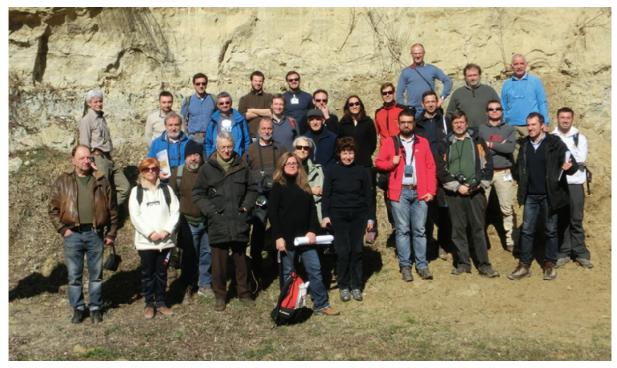
Fig. 3 - The researchers in the front of the deltaic plain silt outcrop of Cascina San Martino (Stop 2)