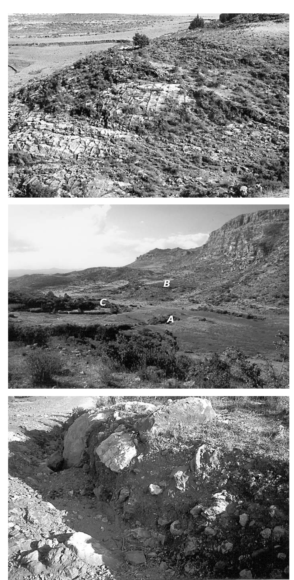
Fig. 4 - Palustrine deposits (A) and debris accumulations (B and C); the former (B) have been partially modeled as terraces by anthropogenetic processes.

Rocce arenacee modellate in superfici convesse e levigate