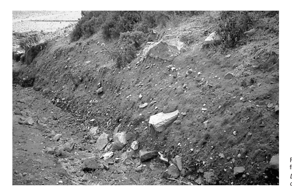
Fig. 2 - Debris deposit at the confluence of the two small valleys. Deposito detritico alla confluenza delle due vallecole

Schizzo geomorfologico del versante a sud-ovest dell'Amba Aradam e ubicazione dell'area studiata. Legenda: 1 – testata di vallecole; 2 – deposito detritico; 3 – roccia modellata in superfici convesse e levigate, con tracce di scanellature; 4 – deposito palustre; 5 – depositi detritici (5b: diamicton).