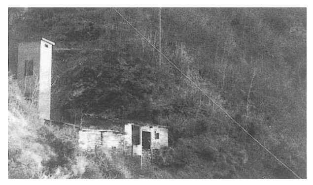
Fig. 2 – System of Mercury Mine of Levigliani.

From the bus stop, through an artificial entrance created inside an abandoned mining extraction we enter the Antro del Corchia . With its 50 km and more of galleries and a depth of 1210 m, the cavern is the most extensive Italian karst cavity and one of the largest in the world. Via a walking itinerary of about two hours we can savour the typical fascination of the hypogeous karst processes, and we can understand important elements of the geological evolution of the Apuan mountain chain, such as the various phases of