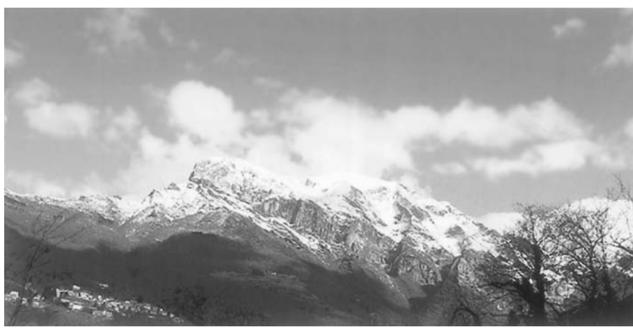
Fig. 3 - The hercynian unconformity of Monte Corchia. La discontinuità ercinica di Monte Corchia.

Impianti della Miniera di Mercurio di Levigliani (foto di S. Mancini 1988).