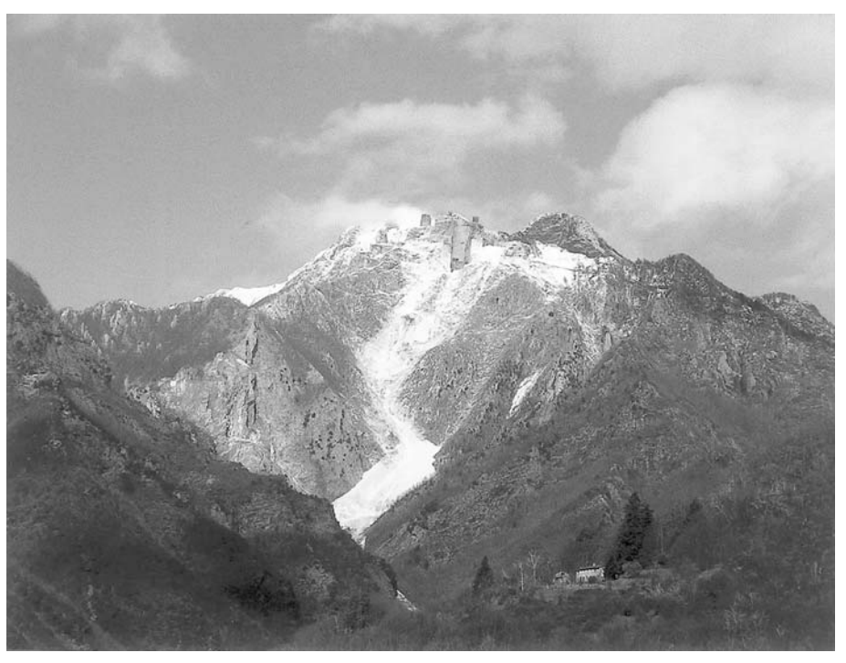
Fig. 4 - The "Cervaiole" quarry in the M. Altissimo area. La cava "Le Cervaiole" su Monte Altissimo.

Returning to Levigliani following the road to Pian di Lago and Passo Croce we reach Fociomboli and from here, following C.A.I. footpath n°11 we arrive at the Padule di Fociomboli (Peat bog of Fociomboli) recognised as a "site of EU interest" due to its notable naturalistic features