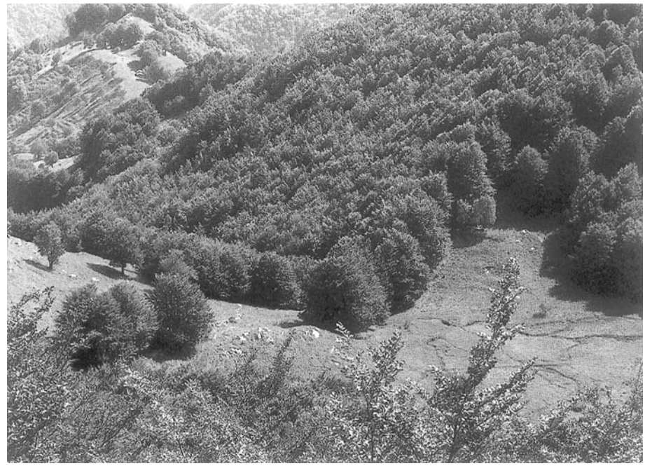
Fig. 5 - View of the Peatbog of Fociomboli. Vista panoramica del Padule di Fociomboli.

(Fig. 5). The current peat bog is the remains of an ancient glacial lake. A careful look at the landscape enables us to reconstruct the appearance of the area during the last glaciation. One of the southernmost glaciers of the Apuan chain occupied this area. It extended along the northern walls of the mountain starting from a height of 1500-1600 m, as shown by the current glacial cirques, and reached, uncovering some rocky spikes, as far down as 700 m along the Val Terreno . This is