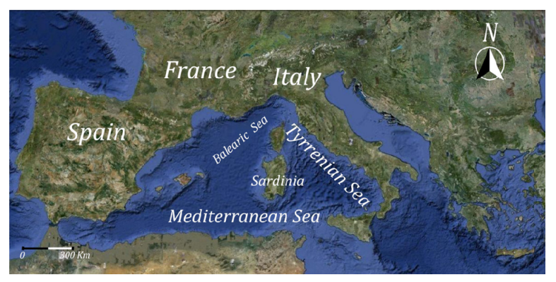
Fig. 1 - Sardinia Island (Italy) in the center of the Mediterranean Sea.

The west and northwest coasts of Sardinia are quasi continuously draped by late Quaternary strata overlapping the older substrate. They have been referred by authors to either the Tyrrhenian interglacial, if characterised by marine deposits resting above the present sea level, or to the "Wurmian" glacial if continental. Just few are referred to the "Riss" glacial phase (Carboni & Lecca, 1985; Carmignani et al., 2001). According to the modern Marine Isotope Stratigraphy (MIS) adopted for Quaternary studies, a deep review of the stratigraphy, especially adopting absolute dating methodologies is needed.